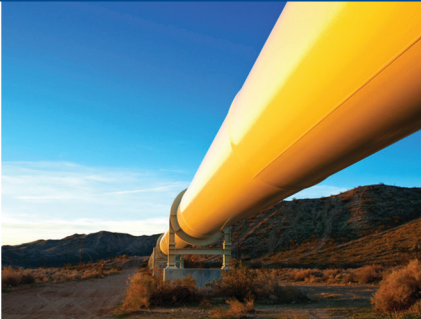
Midstream Oil & Gas