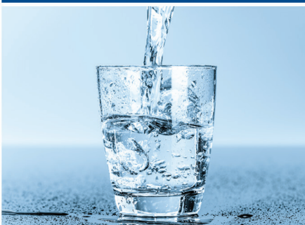
Water & Wastewater

Emerson Impact Partners engineer and deliver solutions across a broad range of industries throughout North America.