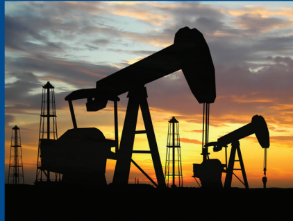
Upstream Oil & Gas